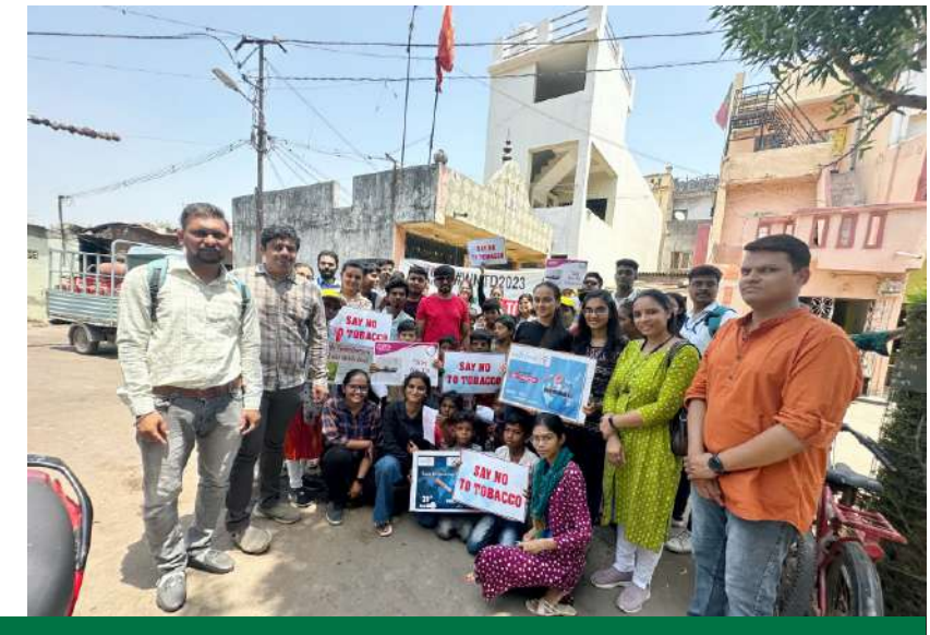
Conducted an event on "World No Tobacco Day" at our Adopted Anganwadi area.