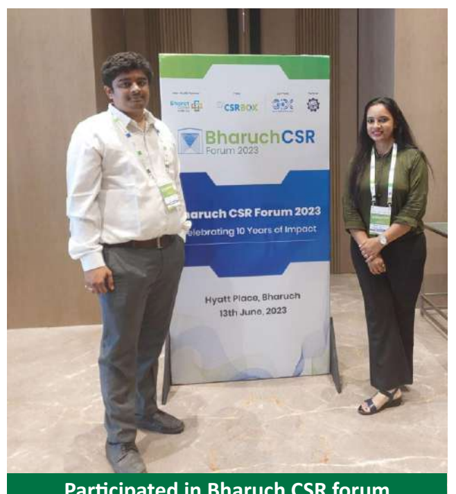
Participated in Bharuch CSR forum